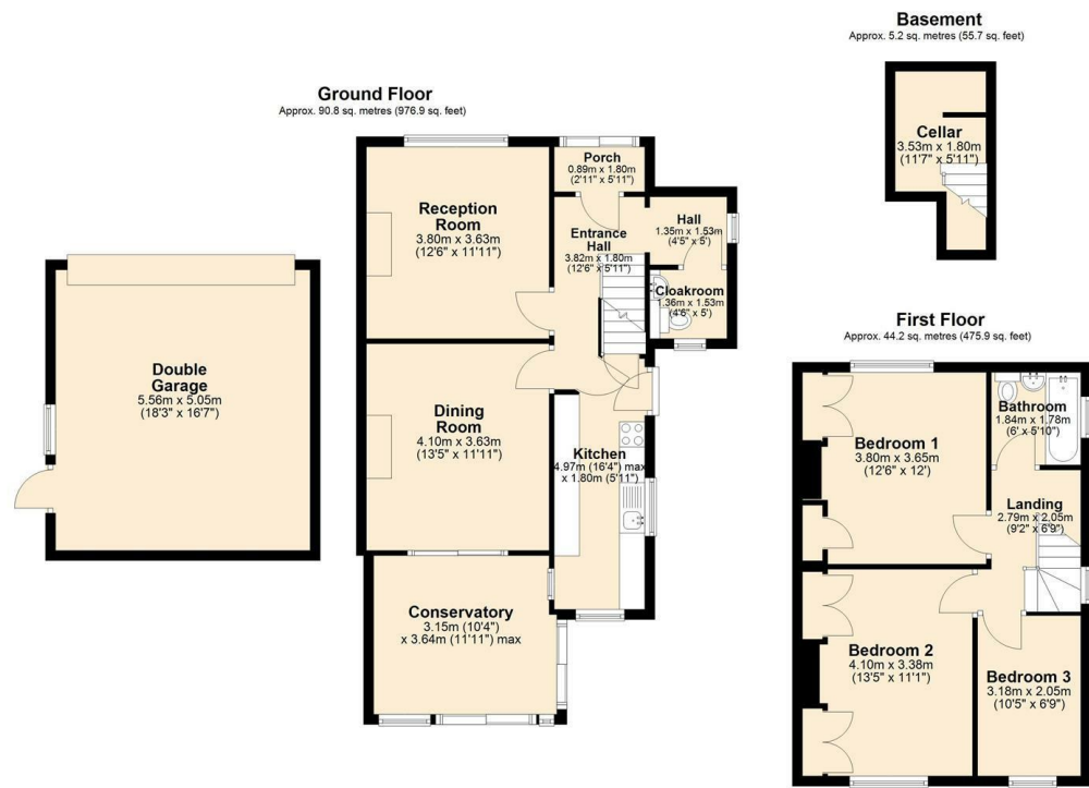
Total area: approx. 140.2 sq. metres (1508.6 sq. feet)

Please contact our Chesterfield Office on 01246 233 333 if you wish to arrange a viewing appointment for this property or require further information.